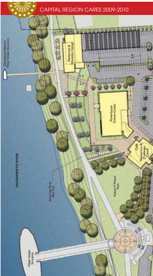
CAPITAL REGION CARES 2009-2010