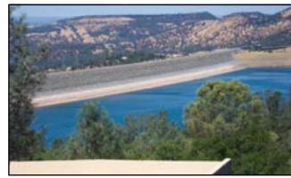
Feather River Branch