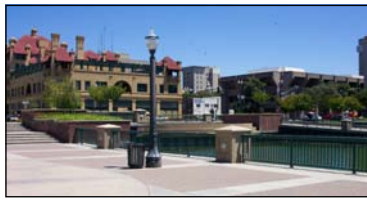
Central Valley Branch